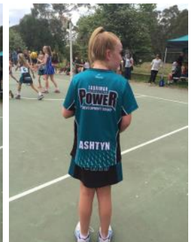
Tournament / Development Squad (Teal)

Web: laurimarnetball.com Team App: laurimarnetballclub.teamapp.com Facebook: facebook.com/laurimarNetballClub