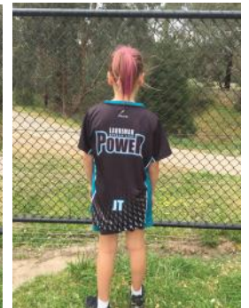
Club Training Top (Black)